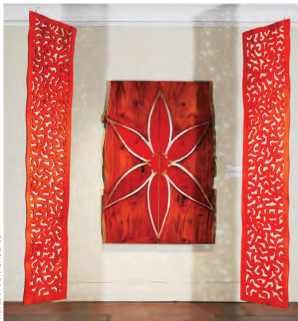
TOP Installation view with Cocoa Walk (2006) in centre, flanked by Breadfruit Kingdom (2006), and with detail of Roots (2006) to the right